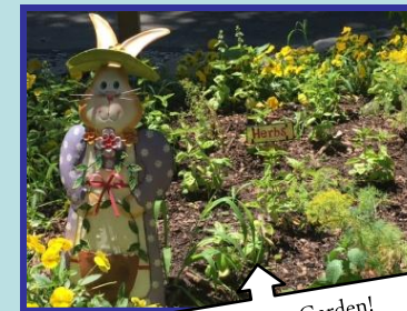
The LakeView Garden!