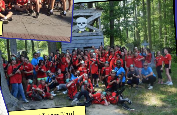
Teens at Laser Tag!