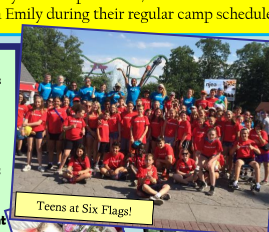
Teens at Six Flags!

When Teens and LVLPs are back at LakeView, they enjoy all that camp has to offer!